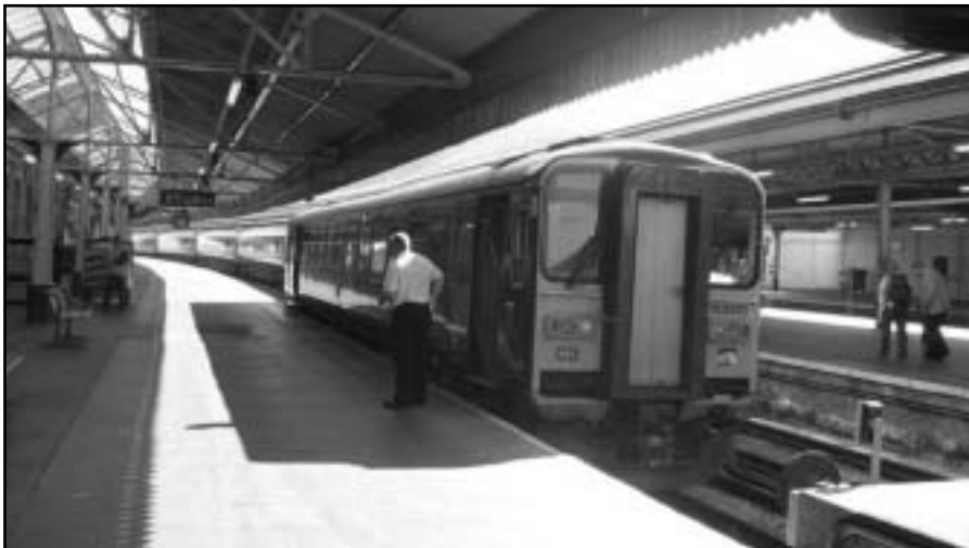
Having reversed in Swansea a through Heart of Wales Line train to Cardiff awaits departure in June 2006.

Nine days of Victorian entertainment, with street entertainers, daytime and evening shows, exhibitions, fun fair, talks, craft stalls and much, much more, all serving to evoke the by-gone days of our Victorian Heritage in a town which exudes a Victorian atmosphere. Train times on the Heart of Wales line again provide excellent opportunities to leave the car at home and make a visit to Llandrindod a relaxing and enjoyable experience.