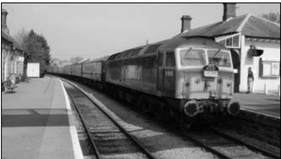
A southbound special draws into Llandrindod Station on 15th April, 2007, the passengers enjoying 3 hours of glorious welsh sunshine.

However, if the nature of the service were to change significantly – two car trains rather than one, for example, or a more intensive service, perhaps with some part journeys, rather than all being 'end to end', then the picture would change. This piece of work will provide a useful aid to future planning.