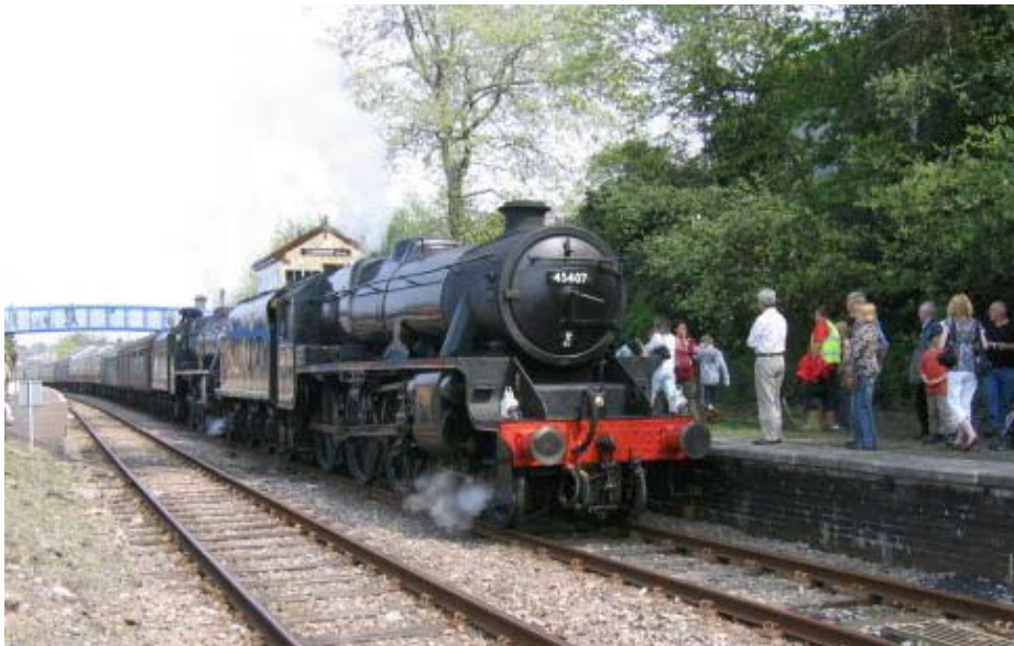
Double Vision - The top picture shows two black 5's on a steam excursion in April 2007, and the bottom shows two x Class 37's on a diesel excursion in May 2007.