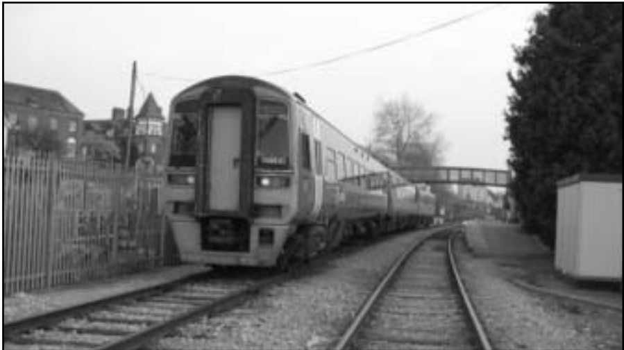
A rare visitor indeed to The Heart of Wales Line. A Class 158 DMU forms part of the evening train to Swansea

And, on that optimistic and romantic note, I will close and wish you all a pleasant and relaxing summer – enjoy the sunshine!