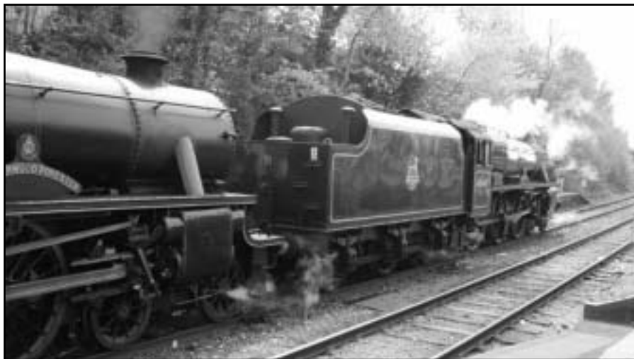
Steam in repose - two LMS Black 5's rest in Llandrindod Station.